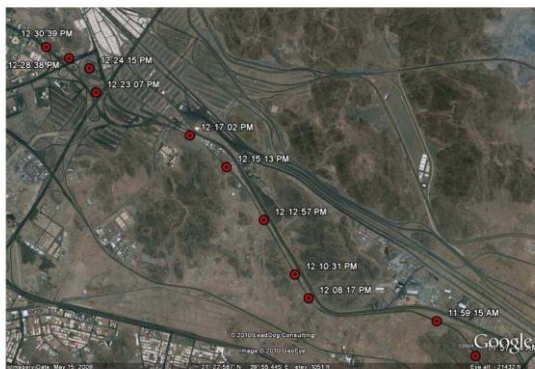
Figure 2. Tracking of Pilgrims in the Holy area.

The developed system was tested on the Holy sites. A master unit and three mobile units were used. The three units were carried by three pilgrims whose movement was restricted to a 50 meter radius from the master unit. The master unit was moved throughout the Holy area to simulate a fixed network spread throughout the area. The mobile units sent their location information periodically to the master unit who sent this information to the server. Figure 2 shows the tracking of the movements of one pilgrim throughout a route that is usually used by pilgrims during Hajj season. It is interesting to see how the system was able to record the exact locations of the pilgrim.