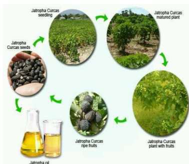
(Various stages in a life cycle of Jatropha plant)[11]

catalyst tends to concentrate in the glycerin, it can become unavailable for the reaction without agitation [12]. After the biodiesel is separated from the glycerol, it contains 3% to 6% methanol and usually some soap. If the soap level is low enough (300 to 500 PPM), the methanol can be removed by vaporization and this methanol will usually be dry enough to directly recycle back to the reaction. Methanol tends to act as a co-solvent for soap in the biodiesel, so at higher soap levels the soap will precipitate as a viscous sludge when the methanol is removed [12].