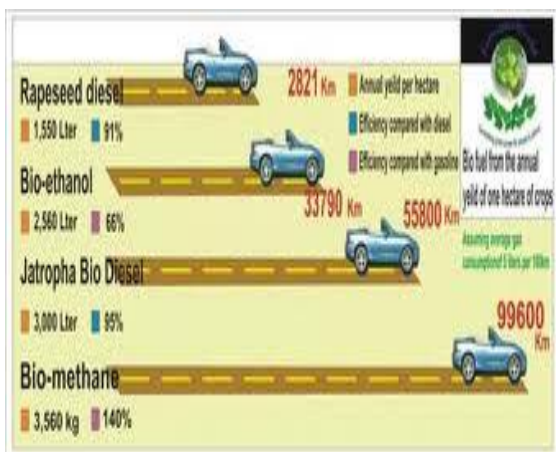
(Comparison of biodiesel with other fuel options)[11]

monoxide (CO) & partial (PM) emissions along with an increase in NOx emission [15-16]. It is being seen in some experiment blending methanol or ethanol with fossil diesel is a new way of reducing smoke & NOx [17-18].