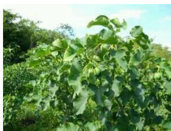
Fig. 1 (A Jatropha plant grown by farmer)[11]

To obtain high yield of Jatropha proper spacing between plants and use of fertilizer has been investigated in this section. An experiment has been carried out on 2 plantations. 1st plantation for spacing and 2nd plantation was to observe Fertilizer the collected data are the seed yield number of fruits weight of the seed plant height during one year cultivation time [10].