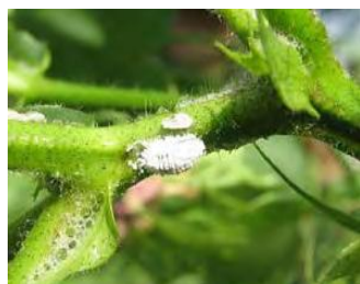
Fig. 2 (a) (Mealy bug on Jatropha Tree) [10]

There are three investigation in this area namely insects, nature predations of Jatropha insects & pollinator. Each investigation was separately carried on lye different research for the insects, mealy bug was controlled by household chemical & natural predator (green lace wing) green lace wing is effective natural predator not only for mealy bug but also aphids [10].