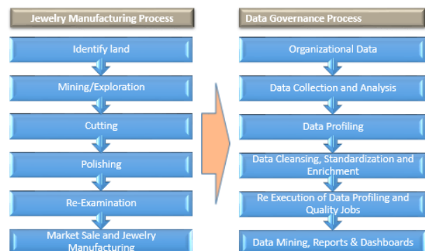
Figure 1 : Governance process mapping in jewelry and data

Figure 1 demonstrates the mapping between various processes involved with respect to jewelry manufacturing and data management