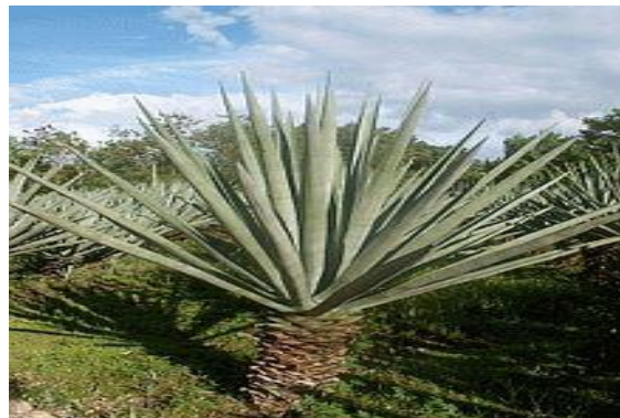
Fig.1 Natural Sisal Fiber

Sisal Fiber is one in all the widest used natural fibre and is extremely simply cultivated. It's obtained from sisal plant. (The plant known formally as agave Sisalana) These plants manufacture rosettes of sword-shaped leaves that begin out toothed, and gradually lose their teeth with maturity. Every leaf contains variety of long, straight fibers which might be removed during a method called decortications.