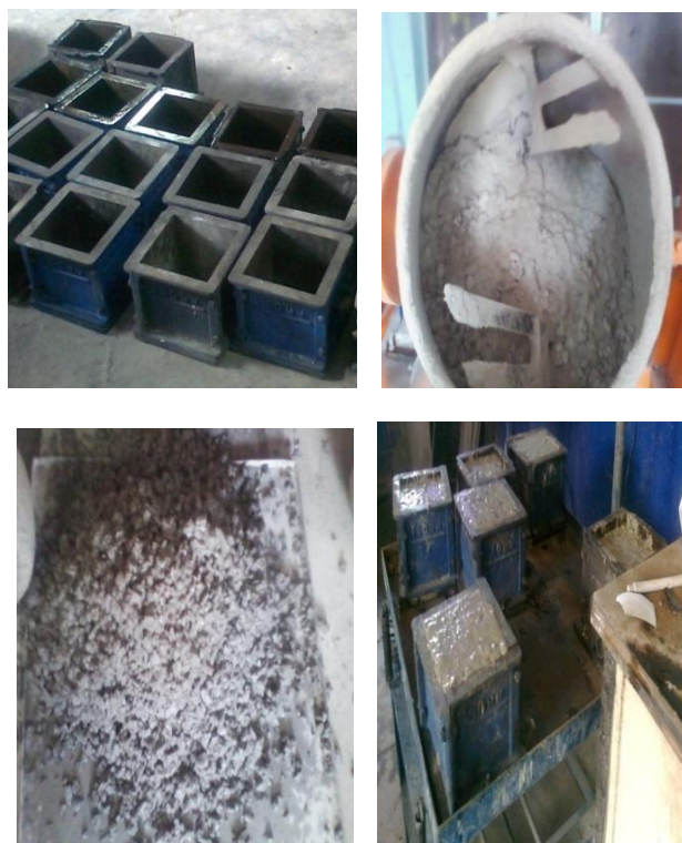
Fig. 2 Making of Sisal Fiber Reinforced Concrete