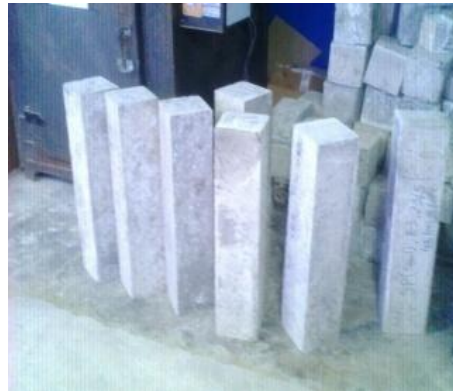
Fig.3 Specimen Sample for Compressive and Flexural Strength.