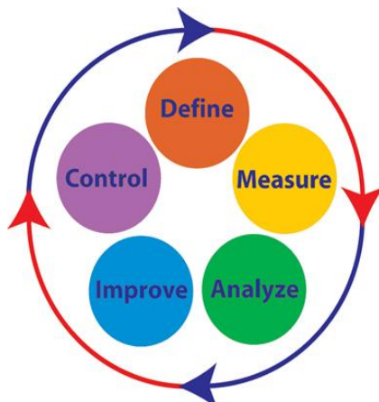
Fig. 3. Six Sigma

The six sigma approach consists of five steps as shown in figure 3 [3]: