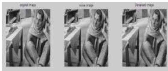
Fig 8 Barbara.jpg original, noisy and denoised image for \sigma=0.1 by contourlet transform