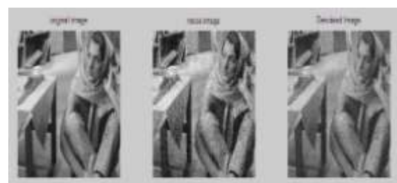
Fig 10 Barbara.jpg original, noisy and denoised image for \sigma=0.25 by contourlet transform