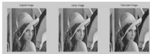
Fig 3 Barbara.jpg original, noisy and denoised image for \sigma=0.1 by wavelet transform

We can observe the quality of restored image by watching the snapshot carefully. In this section we have used images of Lena, Barbara, Pepper, and Car also find the values of PSNR, RMSE and SSIM in wavelet and contourlet domain and compare each result in the tabular form. We have also compare the snapshot of original noisy and denoise images in wavelet and contourlet domain