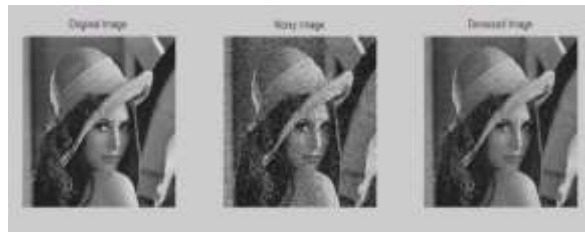
Fig 5 Barbara.jpg original, noisy and denoised image for \sigma=0.25 by wavelet transform