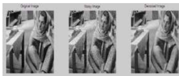
Fig 9 Barbara.jpg original, noisy and denoised image for \sigma=0.25 by wavelet transform