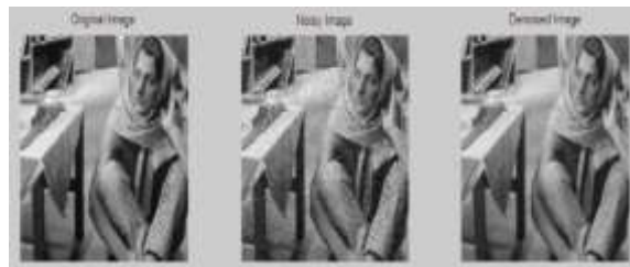
Fig 7 Barbara.jpg original, noisy and denoised image for \sigma=0.1 by wavelet transform