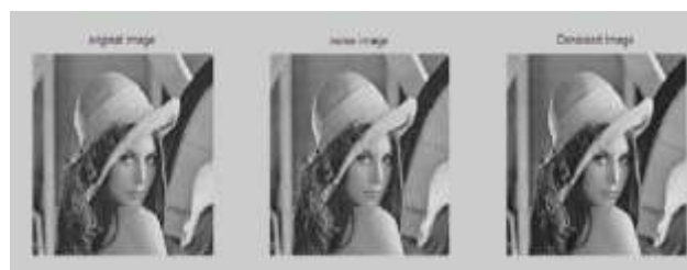
Fig 4 Barbara.jpg original, noisy and denoised image for \sigma=0.1 by contourlet transform