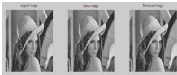
Fig 6 Barbara.jpg original, noisy and denoised image for \sigma=0.25 by contourlet transform