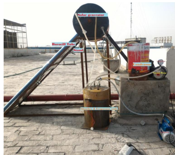
Fig.5 Complete setup of the system