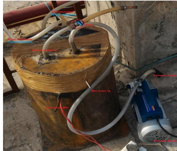
Fig.4 Evaporator and Absorber Tank