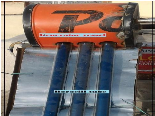
Fig.2 complete set of generator

mm in diameter and 400 mm in height. It is made up of mild steel sheet.