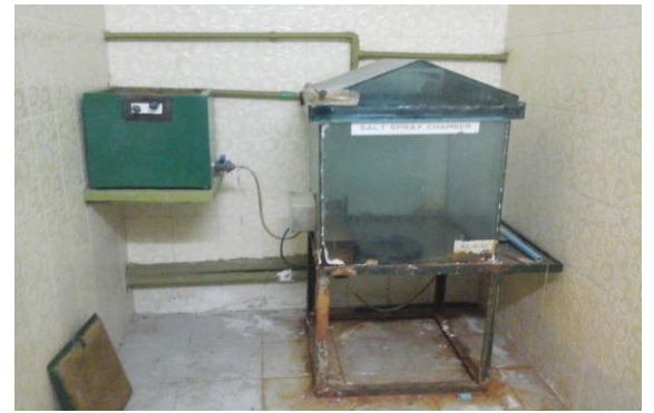
Fig. 4. Salt Spray Chamber with solution tank (ASTM B 895)