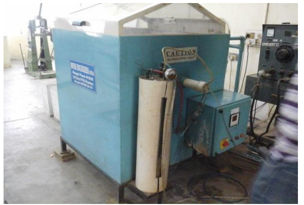
Fig. 3. Salt Spray Chamber ASTM B 117 (high pressure)

A supply of suitably conditioned compressed air, specimen supports, provision for heating the chamber, the drops of solution that fall from the specimen shell not be returned to the solution reservoir for re-spraying.