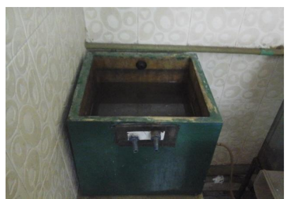
Fig. 5. Sodium Chloride Solution tank (5% NaCl)