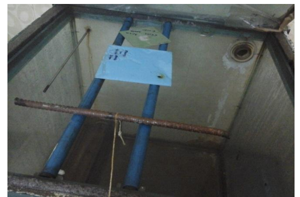
Fig. 6. Corroded Specimen in Salt Spray Chamber

International Advanced Research Journal in Science, Engineering and Technology Vol. 1, Issue 1, September 2014