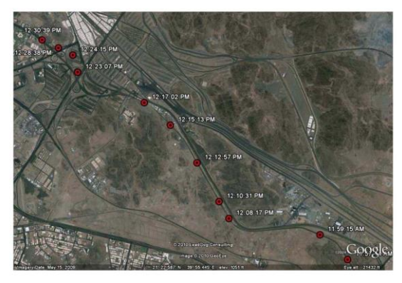
Figure 2. Tracking of Pilgrims in the Holy area.

The developed system was tested on the Holy sites. A master unit and three mobile units were used. The three units were carried by three pilgrims whose movement was restricted to a 50 meter radius from the master unit. The master unit was moved throughout the Holy area to simulate a fixed network spread throughout the area. The mobile units sent their location information periodically to the master unit who sent this information to the server. Figure 2 shows the tracking of the movements of one pilgrim throughout a route that is usually used by pilgrims during Hajj season. It is interesting to see how the system [8] was able to record the exact locations of the pilgrim.