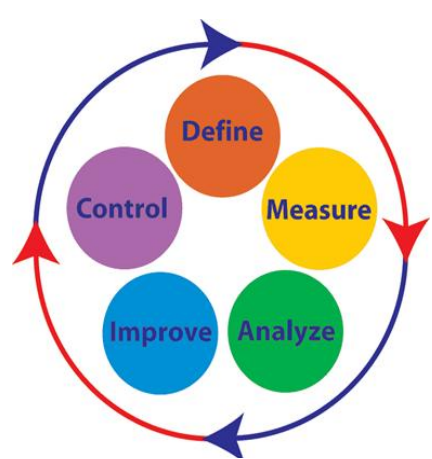
Fig. 3. Six Sigma

The six sigma approach consists of five steps as shown in figure 3 [3]: