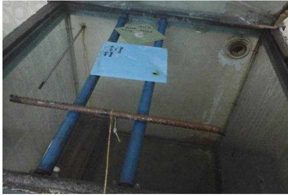
Fig. 6. Corroded Specimen in Salt Spray Chamber