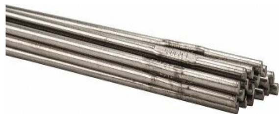
Fig. 2. Stainless steel rebar's (ER 308L)

Corrosion of steel reinforcement is the primary and most costly form of deterioration currently impacting the performance of RC Bridge structures. Eliminating or slowing the deterioration of RC Structures due to the corrosion of steel reinforcement requires the use of innovative Methodologies, which are commonly subdivided into two categories. First, Deterioration is slowed through methods that lengthen the time it takes chloride ions to reach the steel reinforcement, the second includes methods that lengthen the time between initiation of corrosion and the end of service life. To study the properties of different steel we need to know the chemical composition of steel, which differs in different steels, we commonly use TMT (THERMO MECHANICALLY TREATED) bars for construction of structures. Among all the metals, iron is second only to aluminum in natural abundance, making up to 4.7% of the earth's crust, When we go through the chemical properties of steel we will can see different chemical compositions like carbon, manganese, silica, phosphorus, molybdenum, aluminum, nickel, sulfur, chromium, tungsten. All the alloys are most important in making good steel. As history says steels are of different types which have their own importance, i.e. carbon steel, stainless steel, galvanized steel, electroplated steel, tool steel, Damascus steel, wootz steel. Carbon steel and the stainless steel are the structural steels so we considered both of them for testing under corrosion.