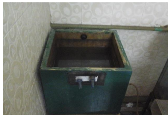
Fig. 5. Sodium Chloride Solution tank (5% NaCl)