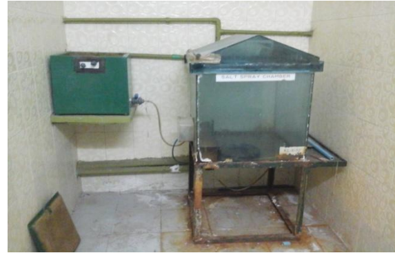
Fig. 4. Salt Spray Chamber with solution tank (ASTM B 895)