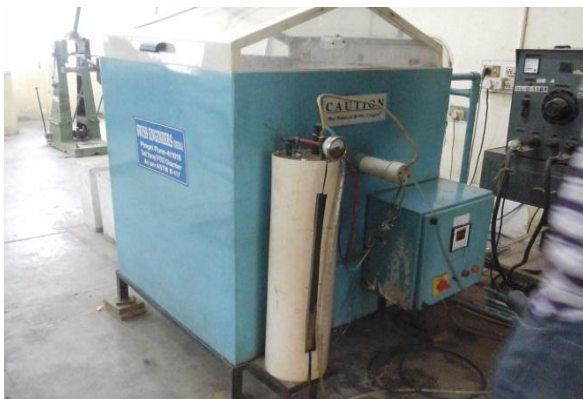
Fig. 3. Salt Spray Chamber ASTM B 117 (high pressure)

A supply of suitably conditioned compressed air, specimen supports, provision for heating the chamber, the drops of solution that fall from the specimen shell not be returned to the solution reservoir for re-spraying.