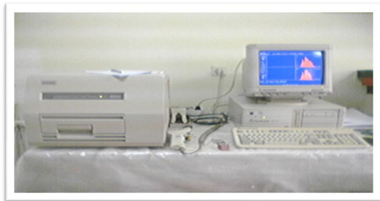
Dosimetric system Harshaw 4500