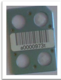
Fig1. Dosimeters TLD-100