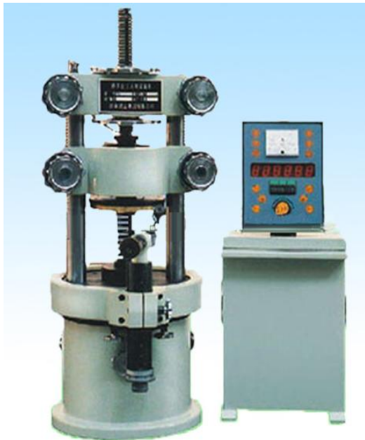
Fig.2 Servo Hydraulic Fatigue Testing machine

The tests were conducted using calibrated Servo Hydraulic Fatigue Testing machine as shown in fig.2 below,