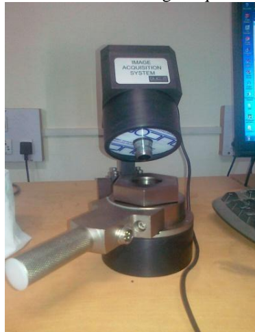
Fig.2. Image acquisition system (Ducom made)

Image acquisition system is used to measure the wear scar diameters on worn lower three balls. Measurement of wear scar is done with the help of Winducom 2014 software. The image acquisition system is as shown in Fig. 2.