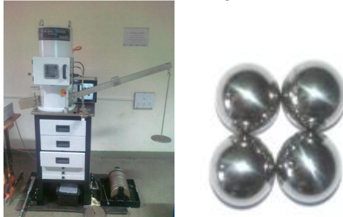
Fig. 1. Ducom—TR 30 L Four ball test rig and testing balls

DUCOM's four ball tester TR-30 family is designed to evaluate anti-wear (AW), extreme pressure (EP) and shear stability behavior of lubricants. This apparatus measures the coefficient of friction (COF), wear scar diameter and load carrying capacity of lubricating oils under standard operating conditions. So to evaluate the wear preventive characteristics of lubricant we have selected a standard four ball testing machine with standardized testing method i.e. American Society for Testing and Materials (ASTM D 4172). The four ball testing machine uses four balls made of chrome alloy steel AISI standard steel no. E-52100, with diameter of 12.7 mm (0.5 in.). Out of four balls, three at the bottom and one on top which is tighten into the spindle of the test machine. The bottom three balls are assembling in the test oil cup containing the lubricating oil under test. The top ball is rotating at the desired speed while the bottom three balls are pressed against it. The lubricant under test is characterized by evaluating the wear scar diameter formed on the bottom three balls after the test [17]. The Ducom four ball testing machine is as shown in Fig.1.