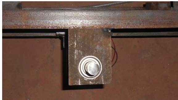
Fig. 3 Bearing