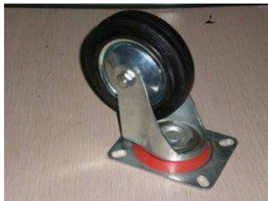
Fig.6 Balancing wheels