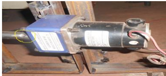
Fig.4 Motor shaft coupled with wheel shaft

The motors used here are DC motors. These are mounted below the structure of the frame. Reduction ratio is 1:50. The motor is of 12V DC, 4.2 amp, 1440 rpm.