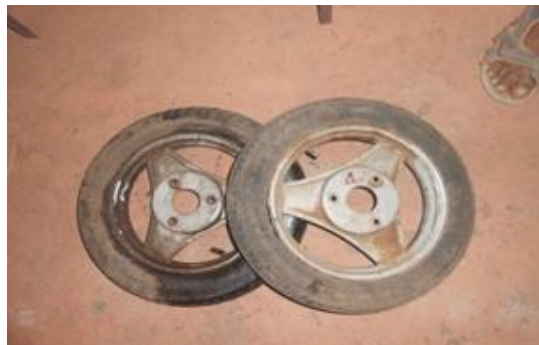
Fig .5 Wheels