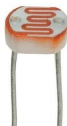
Figure 3: Light dependent resistor

A high intensity LED is used as a light source. The light beam is made to pass through the sample solution contained in the test tube. A LDR is placed exactly on the opposite side of the test tube to detect the amount of light passing through the test tube unscattered. To obtain maximum sensitivity the test tube is covered in wooden shield which has opening only for LED and LDR (Light dependent resistor) to pass through.