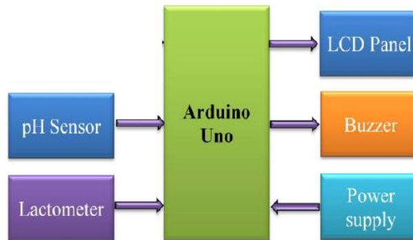
Figure 2: Block diagram of Milk parameter measurement system

This microcontroller comes from a company called Atmel and the chip is known as an AVR. It is slow in modern terms, running at only 16Mhz with an 8-bit core, and has a very limited amount of available memory, with 32 kilobytes of storage and 2 kilobytes of random access memory. The interface board is known for its rather quirky design—just ask the die-hards about standardized pin spacing—but it also epitomizes the minimalist mantra of only making things as complicated as they absolutely need to be. Its design is not entirely new or revolutionary, beginning with a curious merger of two, off-the-shelf reference designs, one for an inexpensive microcontroller and the other for a USB-to-serial converter, with a handful of other useful components all wrapped up in a single board. Its predecessors include the venerable BASIC Stamp, which got its start as early as 1992, as well as the OOPic, Basic ATOM, BASICX24, and the PICAXE.