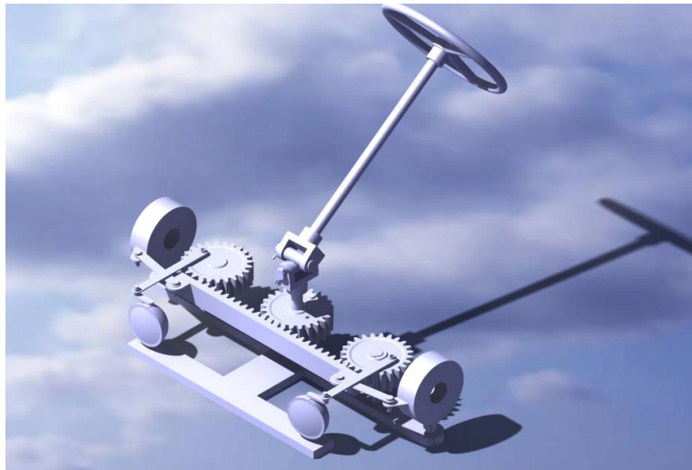
Fig:1 Automatic Turning Headlamp Setup

of the steering column is converted into linear motion using rack and pinion. We use pinions mounted at the ends of the rack to provide input for headlamp to turn horizontally. This pinion act as input link of four bar mechanism to turn the headlamps. Thus, the input from steering rack itself is used to turn the headlamp according steering wheel movement hence eliminating use of sensor or complicated mechanism. Thus, we get the corresponding result in angle turning. Different iterations were done for better angle turning and better visibility by elimination of blind spot.