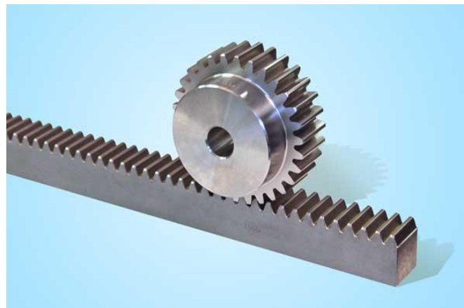
Fig:4 Rack and pinion

A rack and pinion could be a sort of linear mechanism that contains a try of gears that convert movement motion into linear motion. A circular gear i.e., pinion engages teeth on a linear "gear" bar i.e., the rack; rotational motion of the pinion causes the rack to maneuver relative to the pinion, thereby translating the rotational motion of the pinion into linear motion. Here we tend to use three pinion and a rack to get our objective.