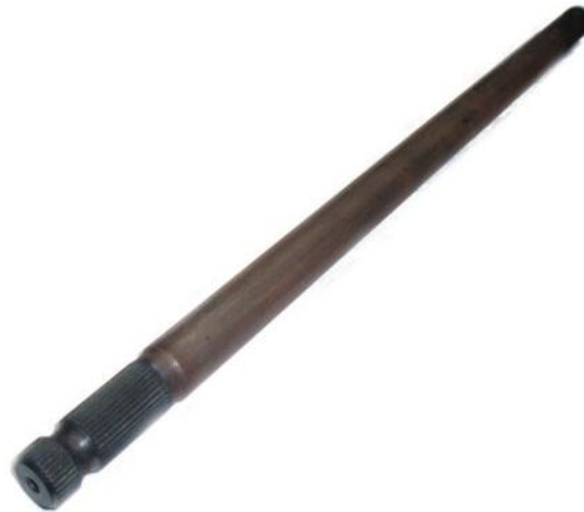
Fig: 3 Steering Column

The automotive steering column is a shaft that is primarily meant for connecting the steering wheel to the steering system or transferring the driver's input force from the steering wheel. One end of column has steering wheel connected to it while another end has pinion attached to it.