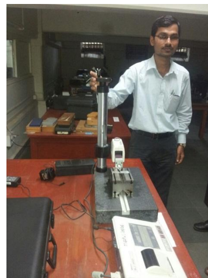
Figure No. 1 Photography of Measurement of R_a value

The surface roughness ( R_a ) of the work piece is measured by using Surface Roughness Tester as shown in figure no. 1 at Production Engineering Department in College of Engineering Pune. The instrument was calibrated using a standard calibration block prior to the measurements. The measurement was taken at four locations (90 apart) around the circumference of the work piece.