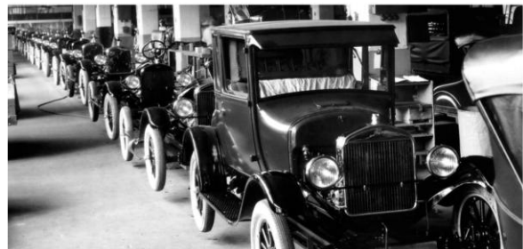
Fig.1.1 An old photo of the Ford Model T assembly line

scale and medium scale industries are not follow the various methods available such that RPW etc, for line balancing or even line developing which may cause the loss of the productivity and time.