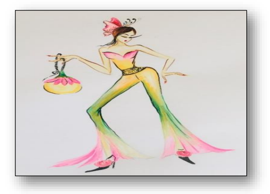
(Author's sketch inspired from the poem 'To A Butterfly')

This sonnet is additionally marvellous to be picked as a moving subject for the magnificent planning of extraordinary ensembles. The head gear utilized in this delineation is eventually similar to a butterfly. Outline of the top and base is likewise roused from the wings of butterfly. The shading plans of the dress are browsed from tulip blossoms. Tri concealed impact is given in the ensemble, hand bag is likewise made from the state of a blossom.