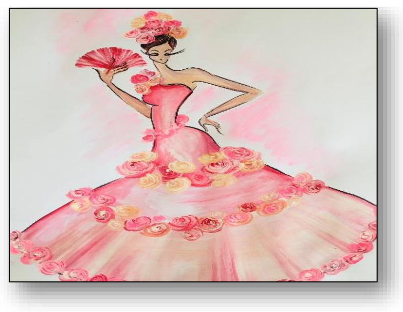
(Author's sketch inspired from the wreath)