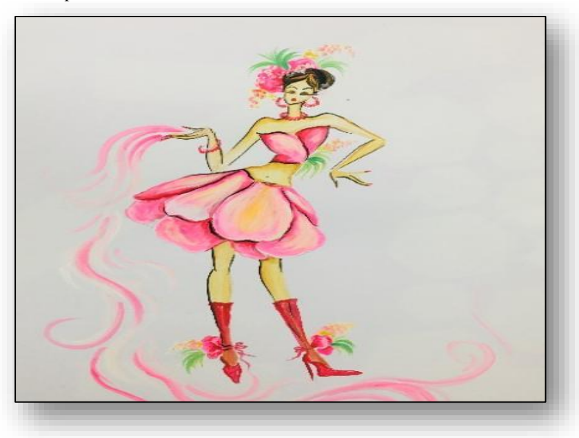
(Author's handmade sketch based on the poetry of flowers)

In this sonnet the writer with the festival of the appearance of spring. The spring season savers each year and it gets incredible mental and enthusiastic change our life. The sonnet exists through the eyes of a blossom which sprout in spring. In this lovely spring season, every one of the blossoms sprout soon after the death of chilled winter. As the whole realize that God is the one in particular who makes the magnificence of the world, this sonnet pays a thankful praise to God and goes through the profundity of good mankind. Thus, the writer has contrasted the excellent human spirit and the period of spring. In this sonnet the artist considers himself a bloom which is alluded to the title of sonnet. Same like genuine blossoms poet is reliant upon the seasons. On the topic of this excellent sonnet, author have made a delightful outline on the spring season. The outfit of women is planned with portrayal of amazing topic. Adornments utilized in the plans are likewise enlivened by the subject of spring blossoms. Silhouettes of the outfit is as fold over as a bloom has the fold over petals.