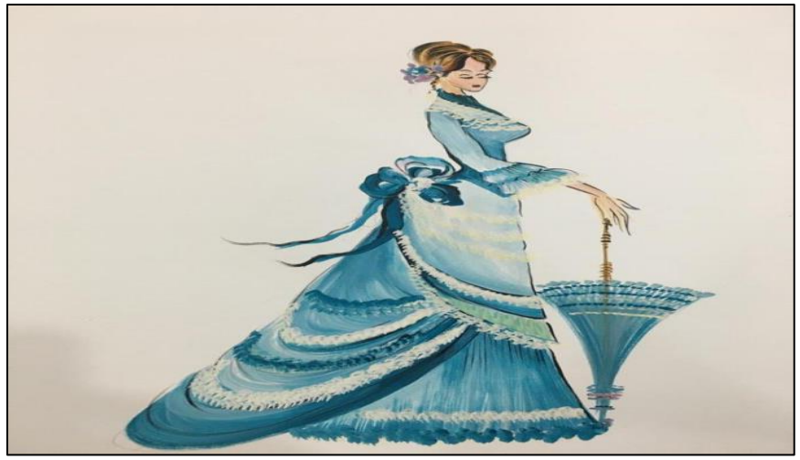
(Author's sketch based on the poem 'She walks in beauty' by Lord Gordon Byron)

He says the magnificence of lady is exceptionally difficult to clarify into words. It shows itself in each strand of her hair which is delicately falling on her lovely face. She appears as though a holy messenger and her other-worldly feelings play on her innocent face. It shows that how the lady is unadulterated and valuable. She uncovers as she goes through her days ethically, that she has a quiet brain and that she has an adoring heart. This is the lovely delineation motivated from the ensemble of Victorian age and her excellence is addressed through it. Her ensemble is additionally roused from the nature and blossoms, coordinating with an accessory umbrella is likewise displayed in her hand. It is decorated with the adornment of bands and trims concurring the design of 1820s, generally great stylization of a beautiful lady is addressed through this representation.