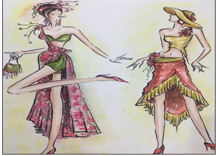
(Author's sketch based on the inspiration from the poetry of PB Shelly)

Researcher contrast the design with this sonnet as a portion of the styles are too fleeting which are called trend. Same like a blossom a few designs get by for certain weeks or months and later on they simply get off from the current style. These two figures are the moving from the botanical example given in the image just as the writers have communicated in their sonnets. One of the ladies is wearing off one shoulder shrug which is planned in botanical print roused from the blossoms in the given sonnets. Lady in the right side is with tulip skirt, this silhouette is made from the state of the tulip bloom. A wonderful communicated sonnet by Percy Shelley, 'the blossom that grins today 'depends on the brief magnificence. These rousing delineations are contrasted and this sonnet as this sort in case outfits are brief and we call them Fad.