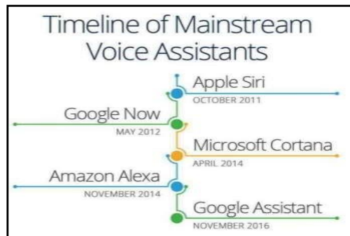
Figure 1: Timeline of Main Voice Assistants

This assistant is just a simple model that might carry out all the simple responsibilities which have been mentioned above however cutting-edge generation is even though right in its miles nevertheless to be merged with Machine Learning and Internet Of Things (IoT) for better improvements. And we also upload GUI to this mission for makes it extra exciting and additionally for person friendly. Personal assistants software program improves person productiveness by means of dealing with routine obligations of the consumer and by using providing records from an internet supply to the consumer. So with a virtual assistant, we are able to be capable of manage many stuff in our desktop/laptop around us with simplest one platform.