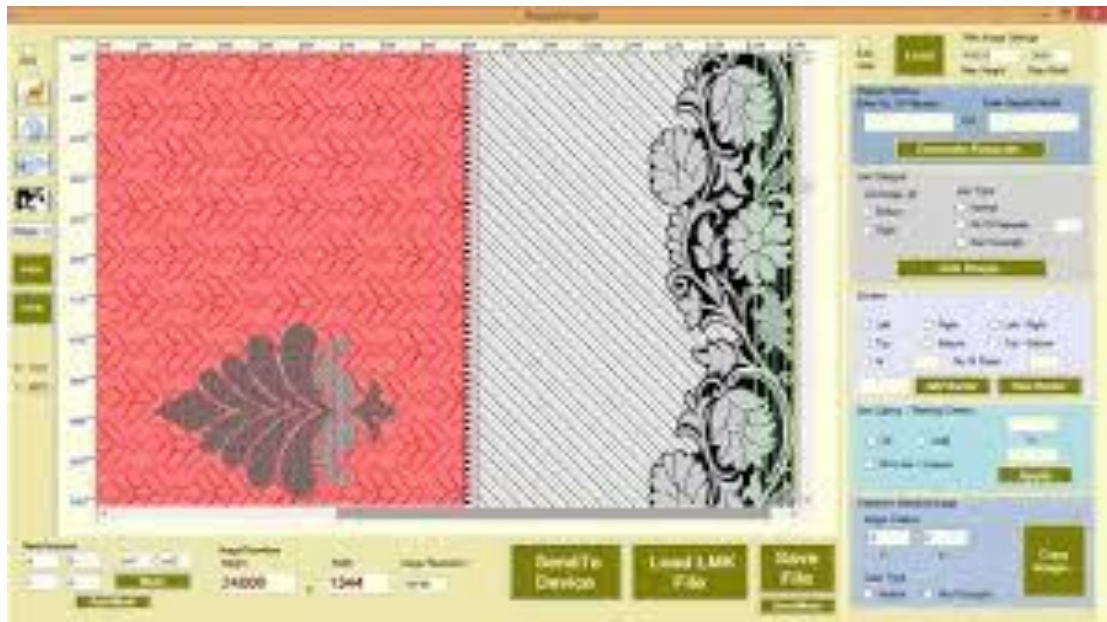
Fig 1: Design creation in MS paint