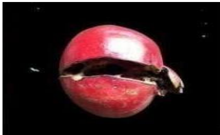
Fig. 2. Segmented Image

According to their relationship to nearby pixels, unknown pixels in a Gaussian mixture model are classified as either probable foreground or background, creating a new pixel distribution. Calculating the weights between the pixels allows one to determine how similar two pixels are. The edges between pixels will be concealed if there is a significant variation between their values. Extraction of features: Extraction of features is essential for correctly identifying an object. Color, mean, homogeneity, standard deviation, variance, correlation, entropy, edges, etc.