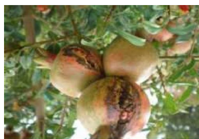
Fig. 1. Bacterial Blight Image.

Image capture: Using a camera, a picture of a plant leaf or fruit is taken. The image that is captured will be an RGB file. If necessary, a picture's scale and colour change should be done during image pre-processing. Preprocessing is the process of preparing an image for later processing by removing noise or extracting the region of interest. This project makes use of Using segmentation, the region of interest can be extracted from the input image.