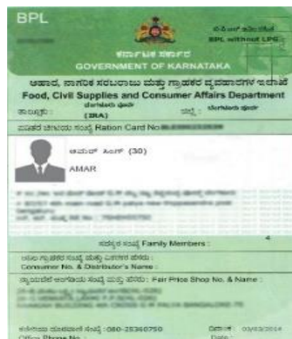
Fig 2.2 Ration card

A ration card is one of the authenticated documents that has been issued and implemented by the government of India to every single family. This card acts as identity proof for a particular individual user for monthly reservation of food grains from a particular ration distribution system. This ration card system identifies every member concerning gender, identity, and photographs.[6]