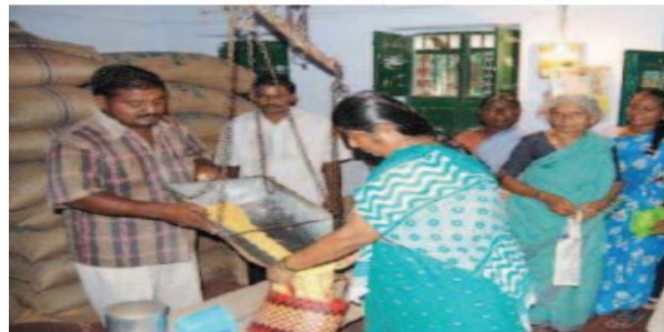
Fig 1.3 Manual distribution of ration in a ration unit

In India, every Indian family is issued a Ration card by the Government of India and the families are to receive concision in food grains as per card. Quantities of food grains are ensured that they will be fixed in terms of monthly requirement based on the income and expenditure of a particular family depending on the number of people residing in the family.