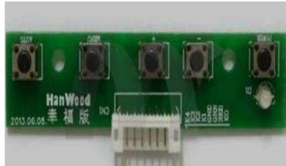
Fig 2.3 fingerprint ration distribution

This system uses authenticated fingerprint detector to provide products to the users. When suitable input has been provided, the products are obtained from an automated ration shop. This system provides products with accurate weight and unnecessary selling of goods can be avoided. The ration shop is connected to the government via GSM to prevent irregularities in ration distribution.[8]