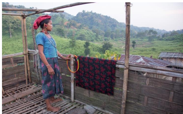
Figure- 11: Mro young lady with traditional attire

Boys and girls play the Pung flute and dress in the Mros' traditional garb. During these three days of celebrations, the fresh jum crop is used to make pitha. Mro does puja twice a year. The Mro language refers to worship as "Khang." Three days are dedicated to Kerai/Kangnat Puja in the months of Falgun, Asadha, and Basumati. Even though there is no set time for puja, it is also done when there are epidemics or other illnesses. The only clothing worn by men is a cloth that covers only the top of their heads and "Kha-ok" Burmese jackets. Mro women go without a top before being married, with the bottom half of their bodies covered by a short piece of fabric (Bennison 1933). The yarn used to make this skirt was bought from Indian vendors. Some wealthy women embellish their waists with a copper-colored ribbon and a necklace made of beads. They are also wearing three-inch hollow silver earrings. During the dance, the men dress in red and don turbans that are covered with beads and feathers. The women also wear flowers, jewels, handcrafted clothes, and money. The Mro themselves make musical instruments during the performance. The musical instrument known as Plong is designed like a bamboo pipe.