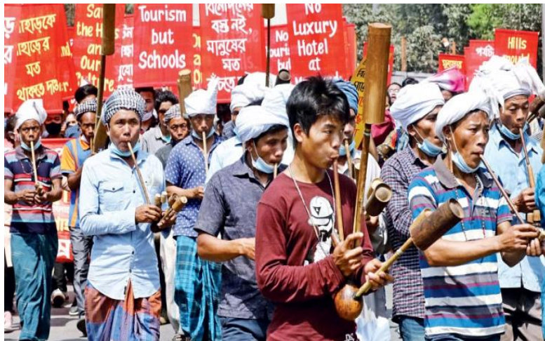
Figure- 02: Mro people play traditional musical instruments in Shahbagh, Dhaka as a sign of protest against corporate aggression on their ancestral land.

argued that this ethnic group needed the ability to continue living in their customary way on their ancestral territory. The "Committee to Save Mro Land on Chimbuk Hill" staged the demonstration in Dhaka, the capital of Bangladesh, to catch the prime minister's attention. An activist for human rights stressed that "wanting to establish a luxury and resort hotel on the ancestral lands of the Mro people is a sin and a crime." It is their traditional and ancestral territory. It's absolutely up to them to decide what they'll do with it. We must respect their democratic right to say "no." Therefore, socialites, intellectuals, professors, and politicians are committed to defending Mro land rights as legal land users (the Daily Star, Dhaka, Bangladesh 3 March, 2021). The discussion above demonstrates that this ethnic Mro group's existence and standard of life are difficult in the present climate.