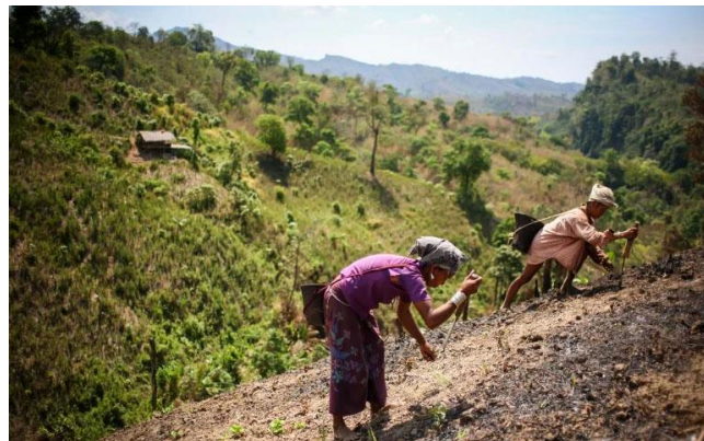
Figure- 08: Mro women putting manual labor at Jhum land