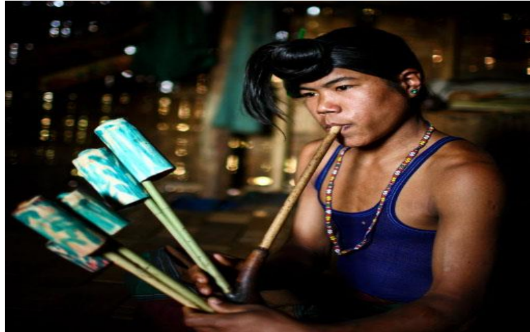
Figure- 03: Young Mro starts braiding hair in this fashion to attract other Mro girls and choose the finest mate