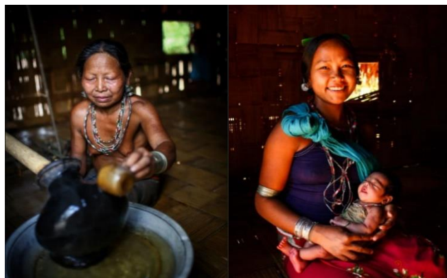
Figure- 14: Mro women with traditional jewelry

Ear piercing is a custom in the Mro culture. Both men and women in Maro culture adhere to this custom equally. In Mrod, it is known as "Raiksharam." It is planned through events and feasts. After the harvest in jumcha, the established Mro family hosts a feast called Chyachat-plii. This event is typically scheduled for December to February. Mro ladies particularly like wearing jewelry and other accessories created by regional artisans. However, at parties or dances, everyone likes having their cheeks, lips, and forehead red. Girls like wearing beaded neckpieces, flower crowns, and ear garlands—all of which are referred to as "kegger" in the Moro language. Girls adorn their arms with silver earrings and metal bangles (ramcheng).