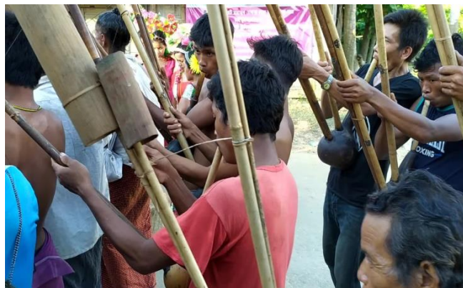
Figure-13: Mro boys and girls play the pung flute