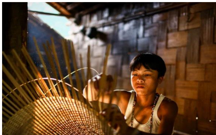
Figure- 17: Mro youngster good at producing bamboo craft-B