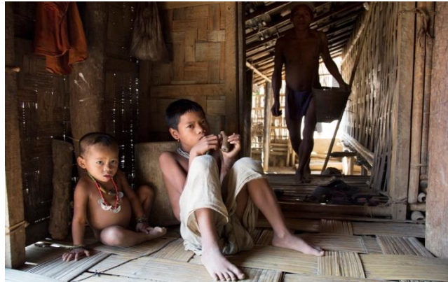
Figure- 05: Mro children