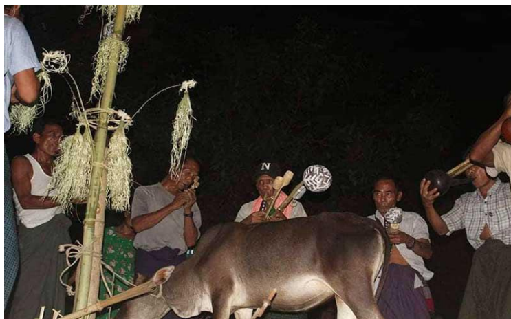
Figure- 15: Mro "nasyatpa" festival