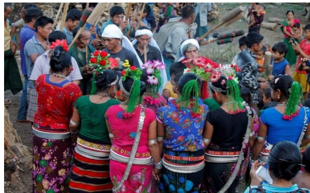
Figure- 10: Mro women performing the Chiasotpoi dance

One of the Mro people's most important social rituals is called chesotpoi or cow sacrificing. Tongue of the cow is cut off. Then, wearing turbans, the people sit on the cow's body. Beer or other alcoholic beverages are served at the feast. Once the meat and most of the cow have been cooked, the whole town congregates to share in the feast. The ceremony has no defined time since anybody with the resources to organize one is free to do so anytime they choose. Everyone at the time was quite busy with their jobs. They deliver the letters using a cow that they send. Cow obeyed their orders and left after being given them before starting to turn around. The cow stopped at a fig tree for a break since she was hungry halfway through. Unconsciously, she swallowed the letter plate, which went into her stomach. When the letters were eventually found, the Mro people were informed and opened fire on the cow. The cow's top teeth were shattered when the Mro chief struck it in the mouth. They complained about the cow being swallowed while the supreme spirit checked, and the spirit commanded them to punish the animal, whatever they saw fit. Furthermore, it was declared to be sinless. As a result, the incensed Mro people resolved to punish the cow by killing it and then chopping off its tongue. As a result, the ceremony got underway. It is now recognized as one of their most important rites (Brauns et al. 1986). Additionally, now you know why the cow does not yet have any upper teeth.