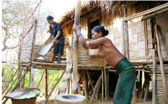
Figure- 12: Mro women with traditional attire