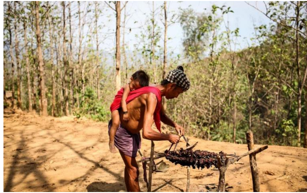
Figure- 09: Mro cuisine