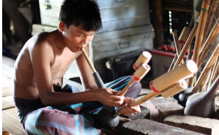
Figure- 16: Mro youngster good at producing bamboo craft-A

Many of the Mro males are excellent at making bamboo products in addition to farming.