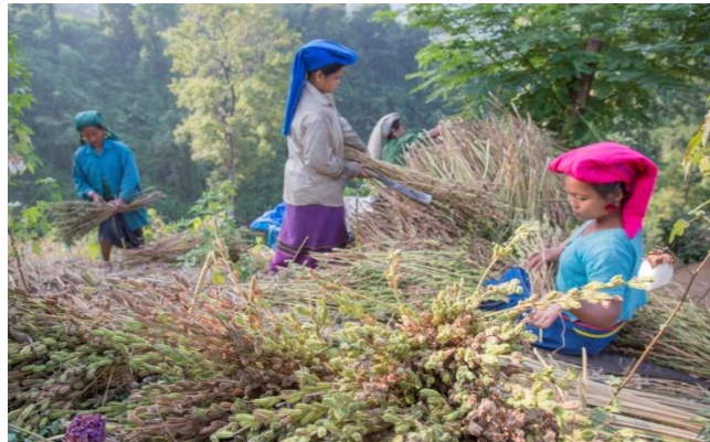
Figure- 07: Mro women at wage earning job

This forced them to move to new fields every two years, making them a semi-nomadic tribe. Men and women both participate in the fieldwork. The primary crop grown by the Mru people is rice. An extremely impoverished people, the Mru. Despite living in a location with abundant resources for timber and hydropower, the villagers lack the skills and information necessary to better their economic situation. They continue to live in poverty as farmers as a result. The Mru rationalize their destitution by asserting that Torai meant for them to live in poverty. They take satisfaction in being self-sufficient at the same time. Every home makes its products. During the weekly marketplaces, they also go to the lowlands to trade cotton for goods like fabric, salt, knives, and ceramics.