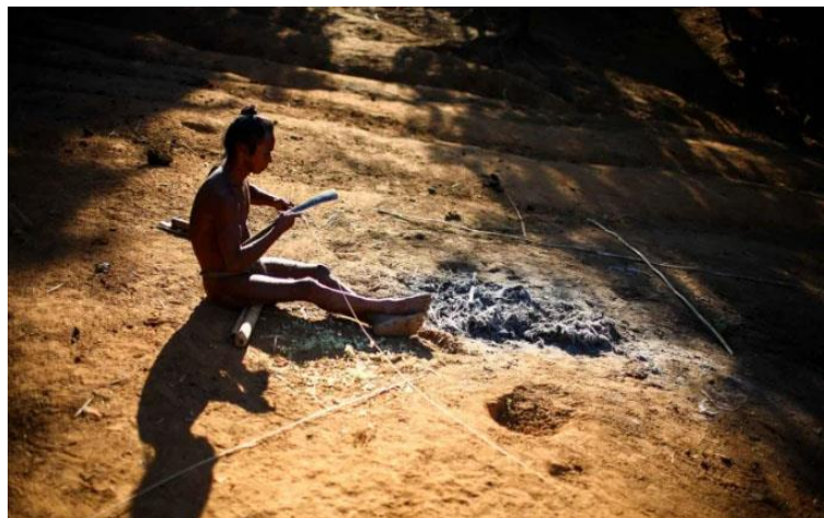
Figure- 04: Mro male busy at work

The Mro have a patriarchal social system, unlike the majority of hill tribes. The family is led by the father. Women's social status or position, however, is a heated subject as a result. It is obvious how women are in command in numerous social spheres as a result. The bulk of the property is left to the sons. However, the youngest son rather than the oldest receives the most of the land. Mro's societal customs dictate that parents raise their youngest son till their passing. Single families do occur, despite the fact that paired couples are more common in Mro society. The Vengua (banana tree), Prenseng (cockroach tree), Kanglai (wild banana tree), Meijer (jackfruit tree), and Ganaru Gnar are other notable tribes (mango tree). Even if the father is the household's head, the daughters assume a leadership position in society. Boys are given the land, with the youngest receiving the bulk. The parents continue to live with the younger son as he gets older. In Mru culture, nuclear and blended families are both prevalent.