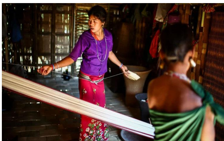
Figure- 18: Mro youngsters apt at weaving-C