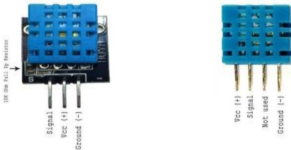
Fig 5: Temperature and Humidity Sensor

The LM35 generates a higher output voltage than thermocouples and may not require that the output voltage be amplified