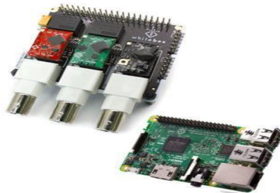
Fig 6: Water level Sensor