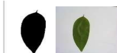
Fig 7: Input image of diseased leaf Cassia Fistula and its conversion to grey scale.