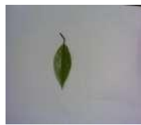
Fig 9: Input image of wet leaf Cassia Fistula and its grey scale Conversion.