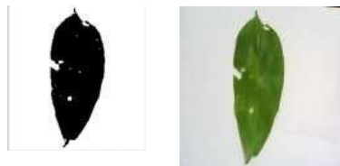
Fig 8: Input image of diseased leaf cassia fistula and its conversion to gray scale