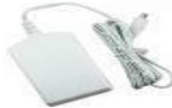
Fig 2: Power Supply

The raspberry pi 3 is powered by a +5v micro USB supply.