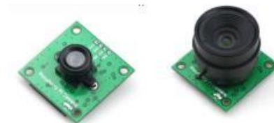
Fig 3: Pi Camera

In order to meet the increasing need of Raspberry Pi compatible camera modules. The ArduCAM team now released a revision C add-on camera module for Raspberry Pi which is fully compatible with official one. It optimizes the optical performance than the previous Pi cameras, and give user a much clear and sharp image. Also it provides the FREX and STROBE signals which can be used for multi-camera synchronize capture with proper camera driver firmware.