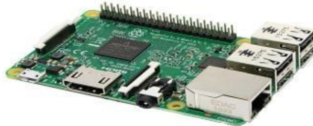
Fig 1: Raspberry-Pi Module

Python as the main programming language, with support for BBC BASIC (via the RISC OS image or the Brandy Basic clone for Linux), C, Java and Perl.