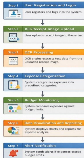
Fig 3.4.1 Workflow

module to extract relevant transaction details such as date, amount, and merchant name. The extracted data is cleaned, structured, and automatically categorized into predefined expense groups. The categorized information is then stored in the database and compared against userdefined budget limits. If the spending exceeds the specified threshold, the system generates an alert notification. Finally, the stored data is used to generate graphical visualizations, enabling users to analyze their expenses on a daily, weekly, monthly, and yearly basis.