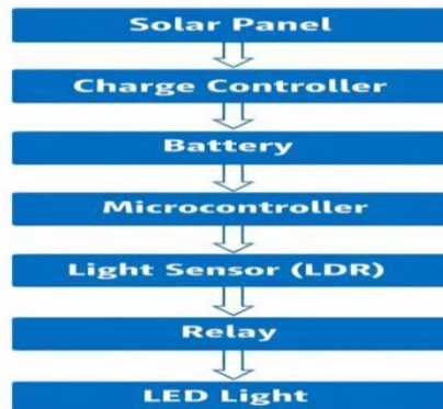
(System Flow Diagram of Smart Solar Energy System for Lighting and Fan Control)