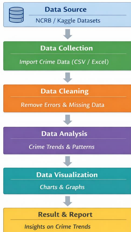
Figure 4.1.1 Data Flow Diagram