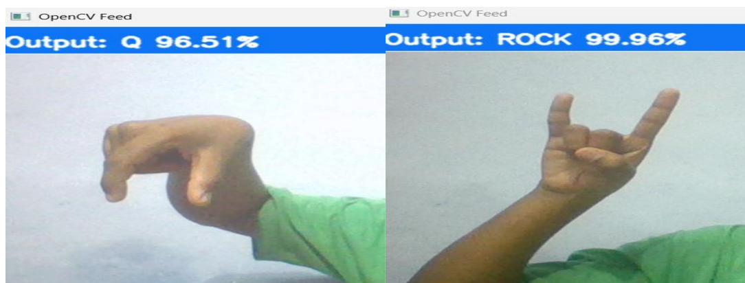
Fig.2 Sign Detection Result

Overall, the developed system provides an effective and practical solution for facilitating communication between individuals with hearing and speech impairments and the general population. While the current implementation focuses on recognizing isolated gestures, future enhancements can include sentence-level recognition, multilingual support, and integration with speech synthesis systems. These improvements would make the system more comprehensive, user-friendly, and suitable for real-world deployment.